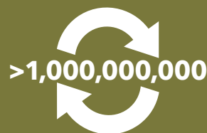
Liters of water recycled