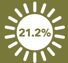
Renewable energy used