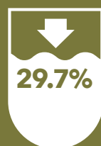
Reduction in water usage